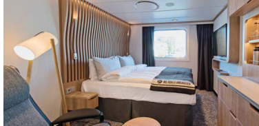
POLAR OUTSIDE, OUTSIDE CABIN