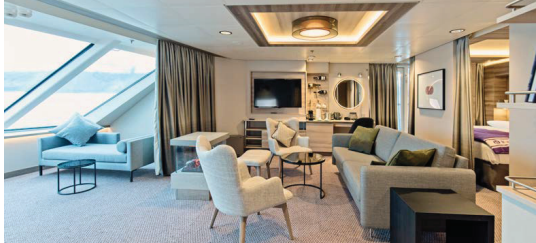
EXPEDITION SUITE, SUITE